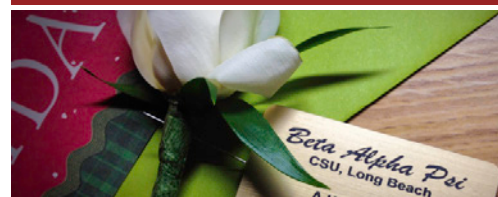
BANQUET RECAP & HIGHLIGHTS