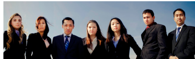
MEET THE SPRING 2014 OFFICER BOARD