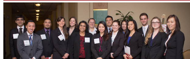
BAP WESTERN REGIONAL CONFERENCE