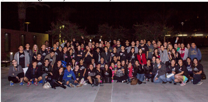
(Below) Big Buddy Little Buddy turnout.