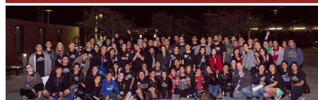
BIG BUDDY LITTLE BUDDY