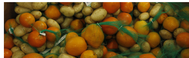
OC FOOD BANK