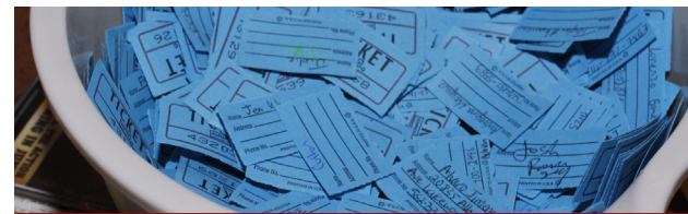
MU CANDIDATE FUNDRAISER